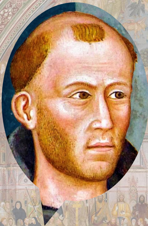
Meister Eckhart, in the Way of Salvation fresco, by Andrea di Bonaiuto, Public Domain, https://commons.wikimedia.org/w/index.php?curid=23887256